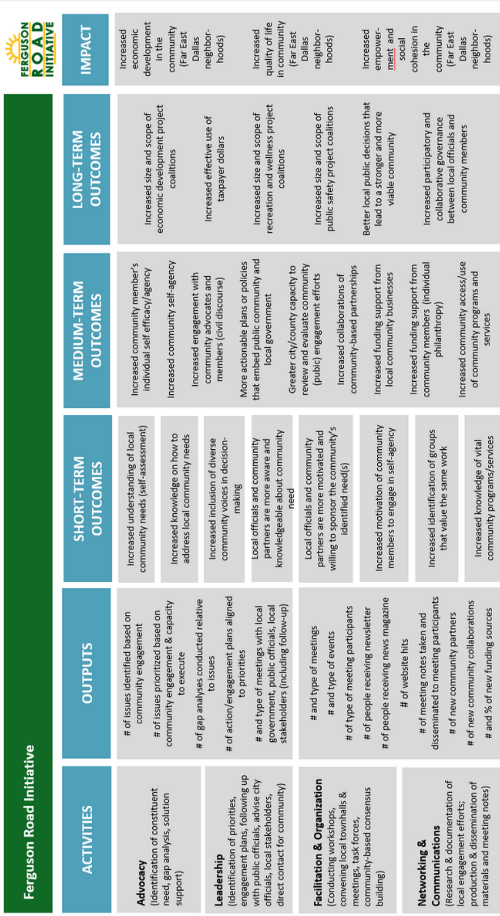
The Ferguson Road Initiative Logic Model.