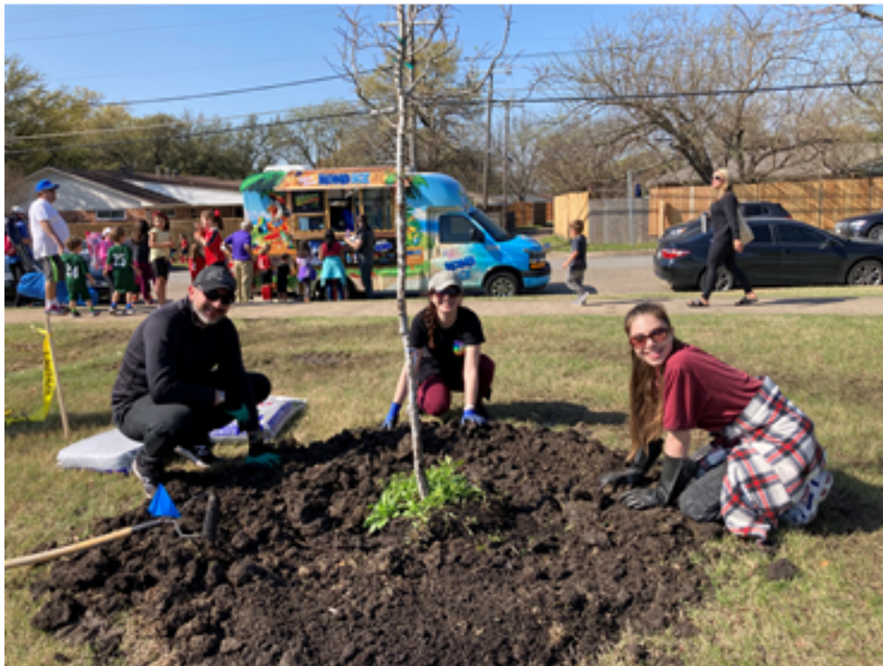
A family works together to plant trees at Lakeland Hills Park.