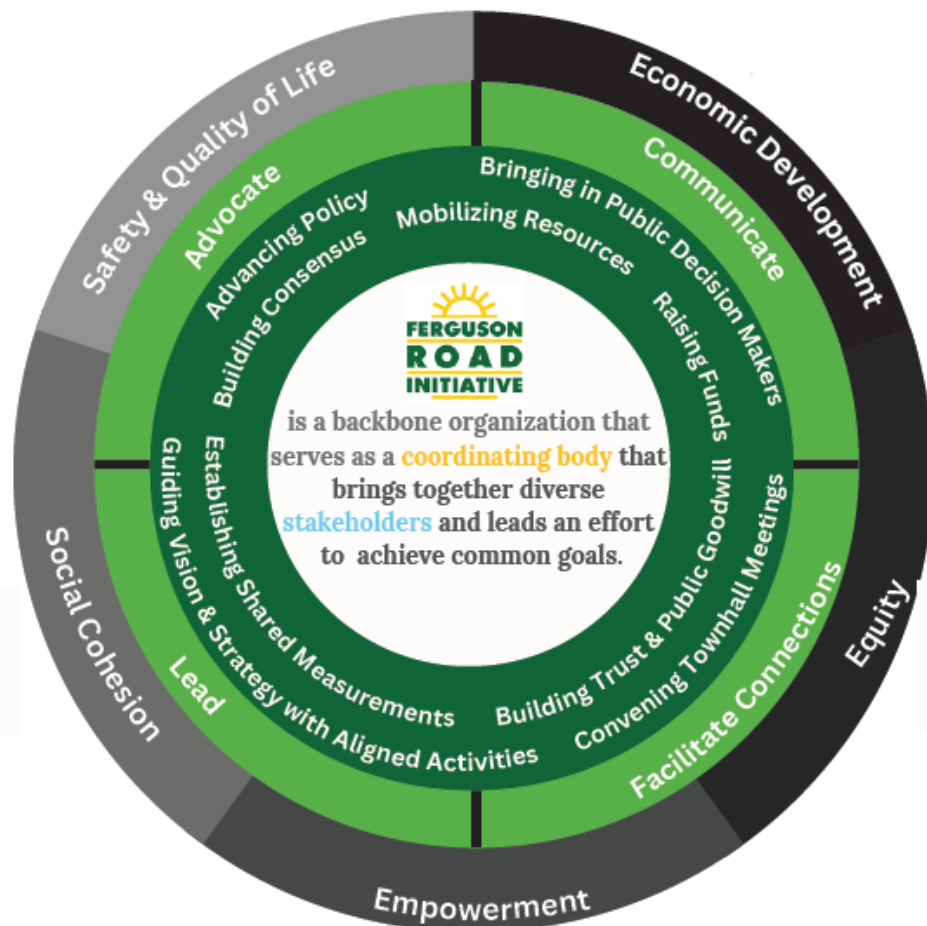
The Ferguson Road Initiative 's role as a backbone organization.

FRI takes a holistic approach to neighborhood restoration, revitalization, and community development. As a backbone organization, one of FRI's roles is to align our common agenda comprised of our mission and vision statements. The diagram below helps to visualize the work of FRI. On the outside of the circle the seven key program activities describe the focus of our work. In the center of the circle, the roles of a backbone organization identify how FRI accomplishes the outcomes that generates collective impact. Our key program activities guide, support, and promote our partner organizations.