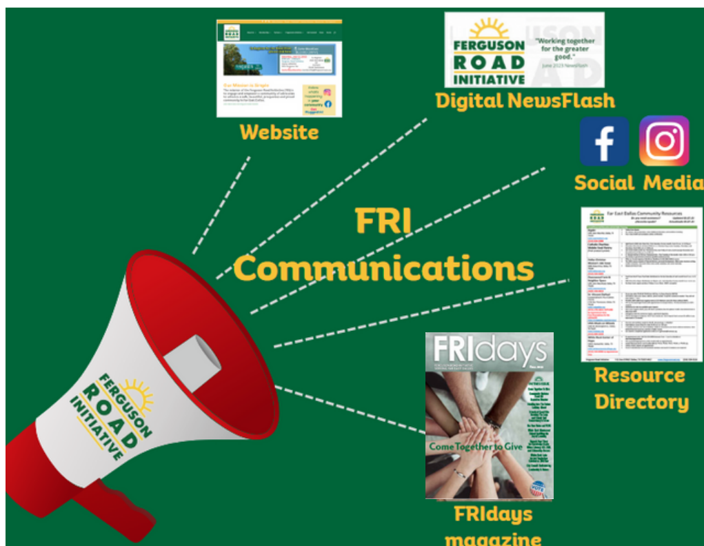
As a backbone organization, Ferguson Road Initiative communicates to the Far East Dallas community.

These communications have helped to inform our FRI service area members about FRI events, services, network resource providers, and project coalition news and updates. FRI communications have been an integral part of our message to the community about who we are and what we do for the Far East Dallas community.