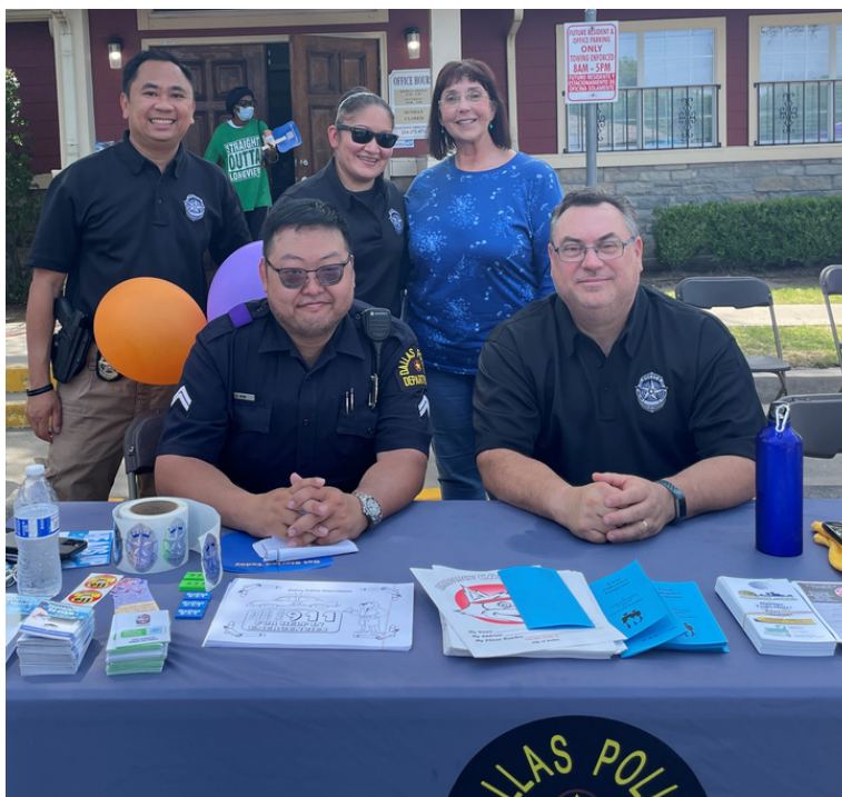
Dallas Police Department and the Office of Community Affairs worked with FRI and the White Rock Hill Townhome Apartments to build community with residents through a resource fair.

We continue to provide support for the Truett Area CrimeWatch quarterly information programs. These meetings are not typical CrimeWatch meetings. Although a portion of the meeting is set aside to identify and discuss neighborhood crime issues, these meetings also provide a training component to them. Past programs have included how to react during an active shooter incident, how to use the city of Dallas app to report code issues, how to use the new DORS reporting system launched by DPD, crime prevention for women, etc. FRI provides support to the program through communication and our participation.