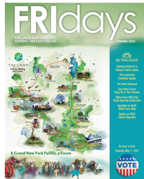
Example of the cover of a FRIdays magazine mailed to the 75228 and 75218 zip codes twice a year.

These communications have helped to inform our FRI service area members about FRI events, services, network resource providers, and project coalition news and updates. FRI communications have been an integral part of our message to the community about who we are and what we do for the Far East Dallas community.