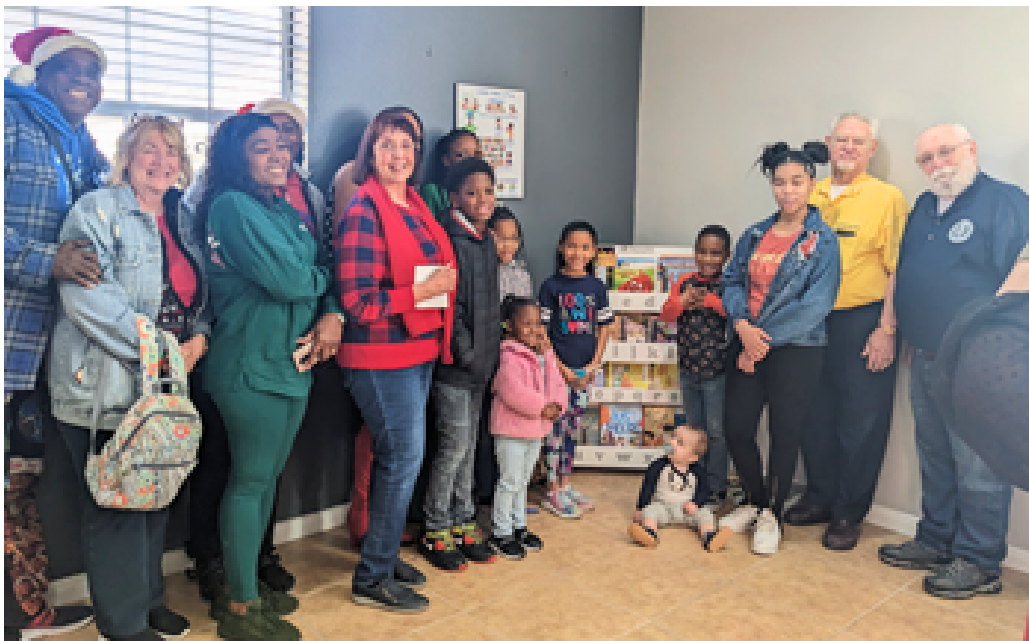
Dallas Founder Lions Club, St. Rep. Jasmine Crockett, It's About the Kids, Peak Living, and the Ferguson Road Initiative launch the opening of the Free Little Library at White Rock Hills Town Home Apartments.

• Free Little Libraries: FRI established, in partnership with the Dallas Founder Lions Club, State Representative Jasmine Crockett, and a new nonprofit, It's About the Kids, a Free Little Library at the White Rock Hills Town Home Apartments (7229 Ferguson Road). The partnership included establishing a community library in the leasing office of the property and ensuring books are supplied to all ages.