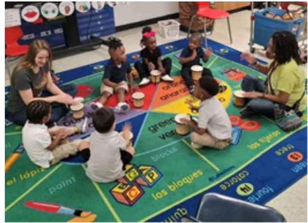
The Artist Outreach provides math and reading enhancements by utilizing rhythm and drumming techniques.

• Book Drive for Kids: In 2022 FRI launched a new partnership with Book Drive for Kids, a nonprofit dedicated to creating a culture of literacy by providing books for disadvantaged children for independent reading. FRI's role was to identify area funding to support free book fairs in our area Far East Dallas schools. This year FRI helped facilitate fairs at White Rock Hills Uplift Preparatory, Bayles and S.S. Conner Elementary Schools providing 1,730 children free new books at a value of $5,400. By working in partnership with Book Drive for Kids, our goal is to serve all 9 of our elementary schools in Far East Dallas.