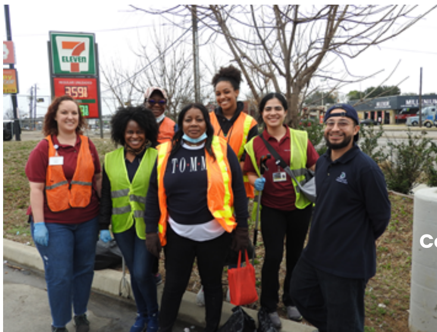
FRI partners with the City of Dallas Code Compliance during annual Operation Beautification Litter Cleanup Events.