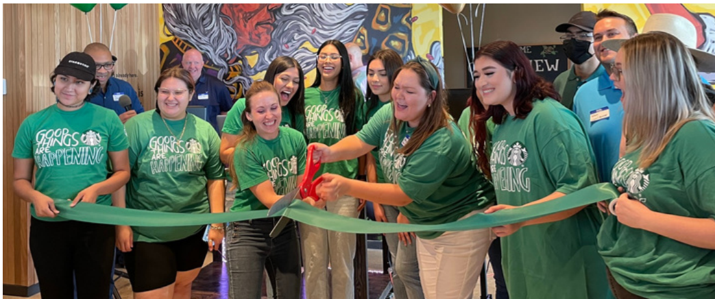
Ribbon Cutting at Starbucks Community Store in Casa View Shopping Center in July 2022.

When leadership in Casa View brought an upgraded shopping center, pedestrian connections and improved intersections to the community, it also attracted the Starbucks Corporation to establish a Community Store there. Starbucks Community Stores are typically