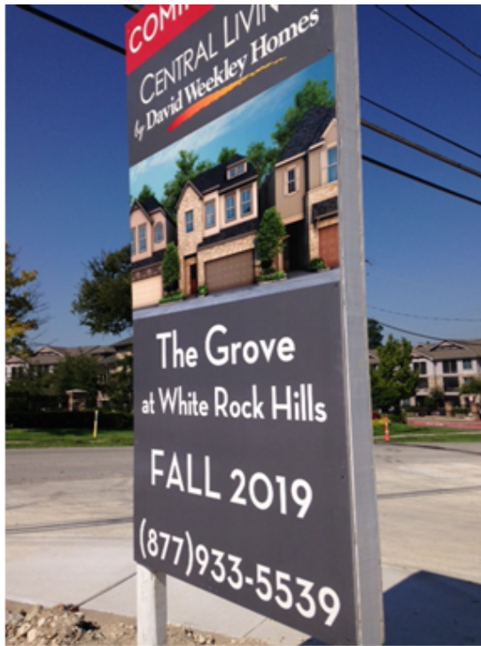
David Weekley's Grove at White Rock Hills offers high-income townhomes within a mixed-income housing neighborhood.

established in underserved areas and are committed to hiring and training locally as well as providing community service to local nonprofits and food pantries. FRI brought areas workforce and food pantry partners together in one meeting to introduce them to the Starbucks Community Store model. Since then, Starbucks has trained and hired 32 residents from the Far East Dallas area and Starbucks employees donate time to nonprofit organizations like the Wilkinson Center.