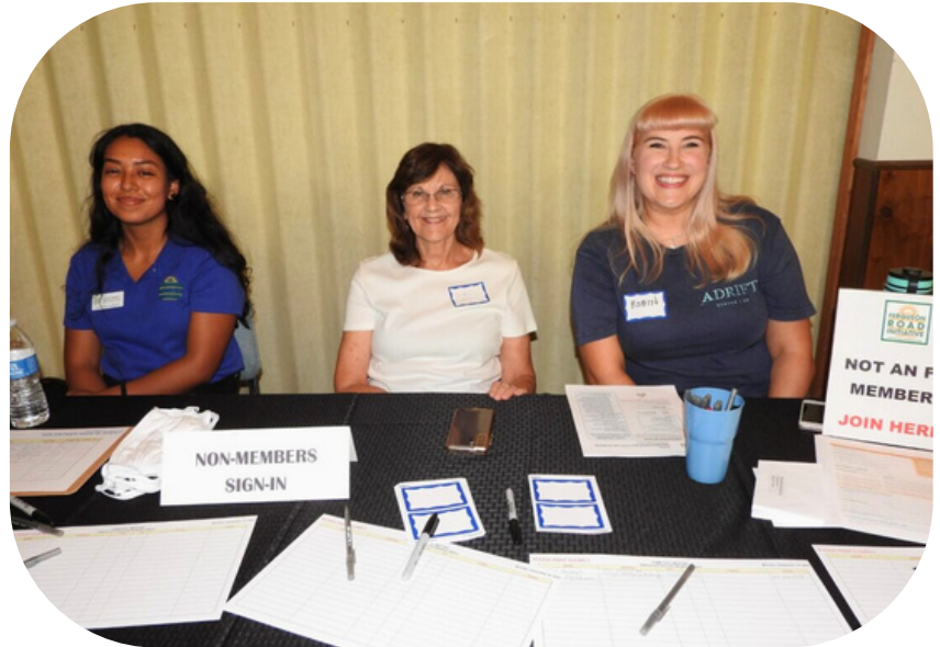
Greeters check-in members and visitors at the Community Connection Townhall meeting.

The development of an Impact Report is allowing us to better analyze and communicate our long-term successes and challenges. Our Impact Report is aiding us in maximizing our reach and making a positive impression to our donors, supporters, and philanthropic foundations.