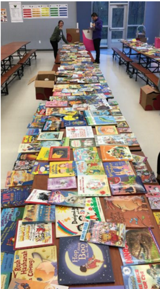
Books collected by Monster Yogurt at Casa Linda Shopping Center for Far East Dallas schools. FRI communicated the Read Across America book drive through our media platforms resulting in the donation of 3,000 books!

• Read Across America: FRI helped our business partner, Monster Yogurt, communicate the Read Across America book drive program. Monster Yogurt collected 3,000 books that were provided to Truett Elementary School and other local charities and Free Little Libraries in Far East neighborhoods.