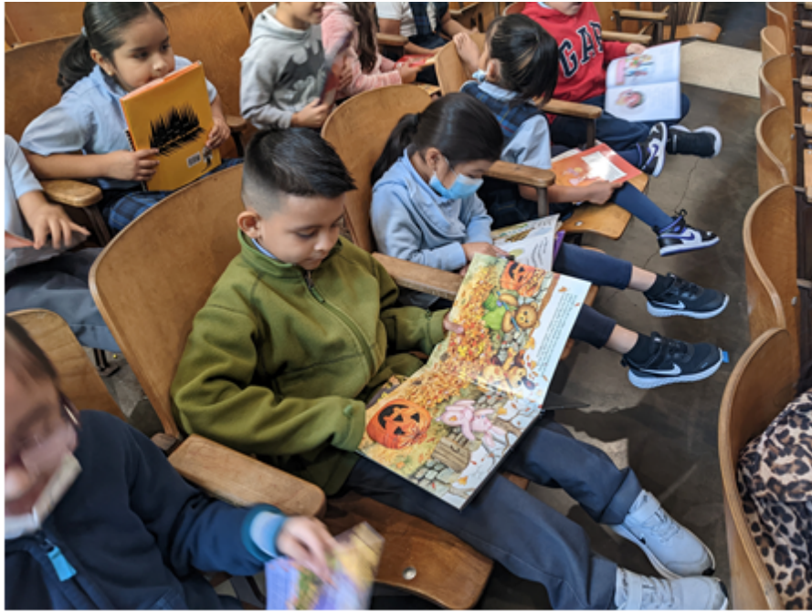
Bayles Elementary School students enjoy reading their new books, provided by Book Drive for Kids, the Ferguson Road Initiative, and various philanthropic partners.

• Free Little Libraries: FRI established, in partnership with the Dallas Founder Lions Club, State Representative Jasmine Crockett, and a new nonprofit, It's About the Kids, a Free Little Library at the White Rock Hills Town Home Apartments (7229 Ferguson Road). The partnership included establishing a community library in the leasing office of the property and ensuring books are supplied to all ages.