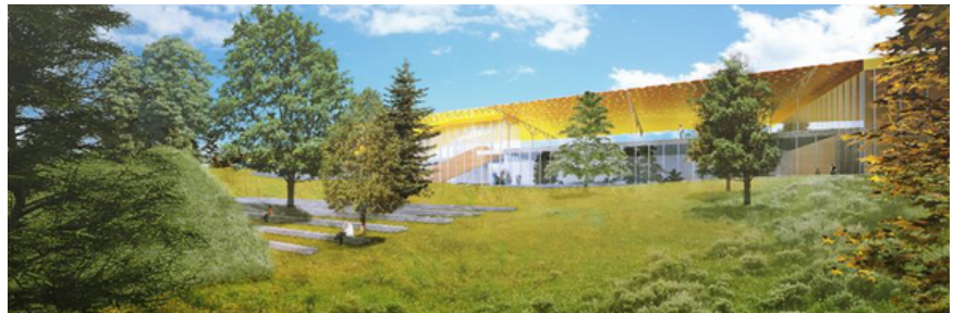
A rendering of the White Rock Hills Recreation Center by Jacobs Engineering in 2015

Green spaces and recreation CENTERS function as “social infrastructure.” They bring people together but are also catalysts for propelling a broader agenda of social initiatives and achieving a wide range of community goals. It is well documented that CENTERS have a positive impact on community youth. They provide opportunities for education, promote active and healthy communities, increase property values, and contribute to economic development. CENTERS foster community pride and bring diverse populations together. They provide opportunities for interaction, inclusivity, and community learning.