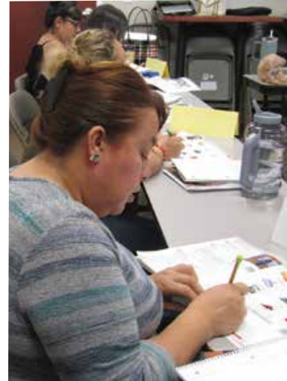
Pictured above, ESL class in session

If you would like to be a part of Aspire's community, you can become a donor or a volunteer at their website at www.aspiretolearn.org or call at 214-824-2000.