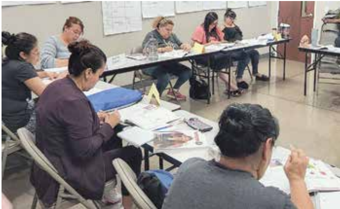
Pictured above, GED class in session