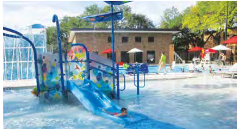
Pictured above; the Harry Stone Neighborhood Aquatic Center opens.