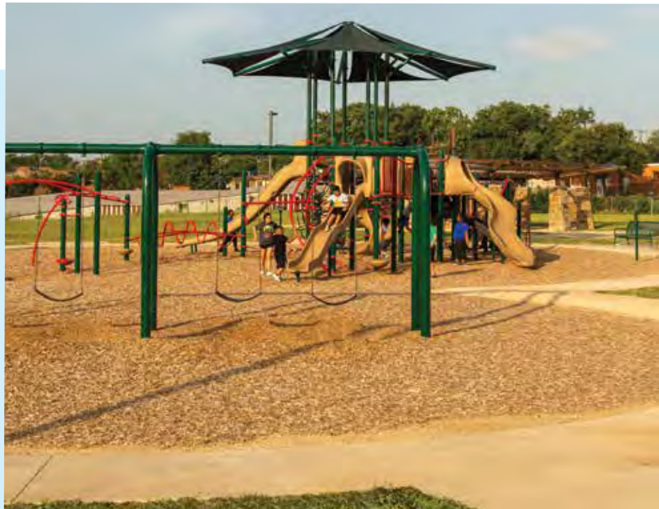
Pictured below; White Rock Hills Park features a grand climbing tower