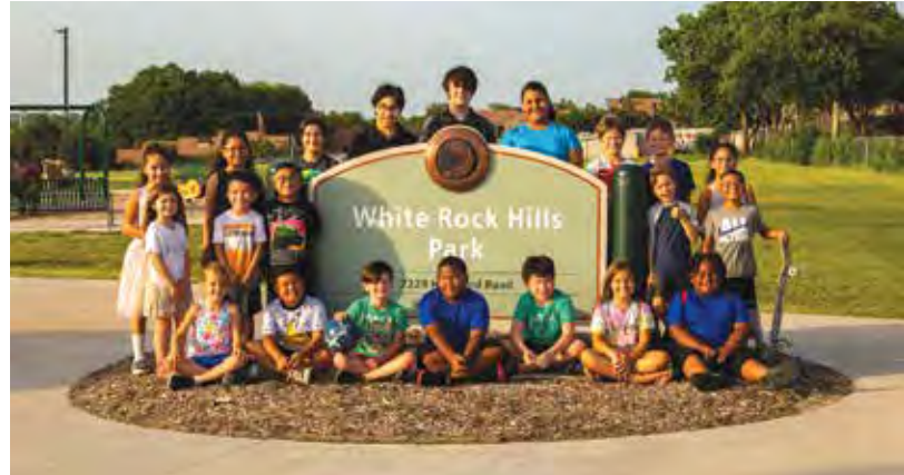
Pictured above; Area children gather for a photo around the White Rock Hills Park sign